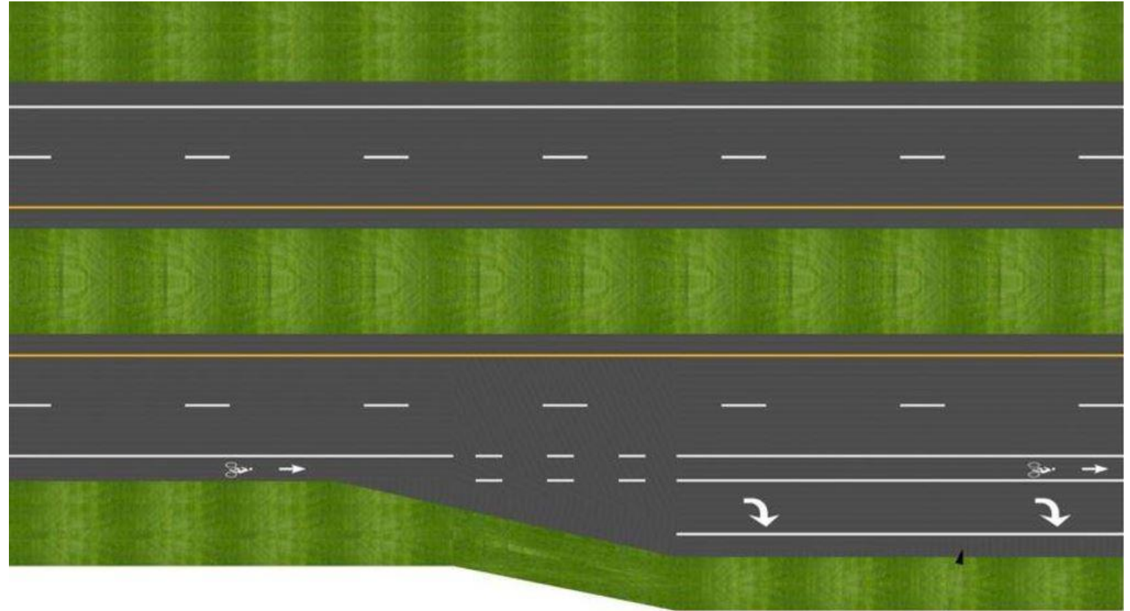
Restriping for Bike Lane